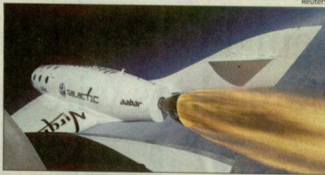
VOYAGE TO THE FINAL FRONTIER

The test of space vehicle, SpaceShipTwo (SS2), conducted by teams from Scaled Composites (Scaled) and Virgin Galactic, officially marks the company's entrance into the final phase of vehicle testing prior to commercial service from Spaceport America in New Mexico. "The first powered flight of Virgin