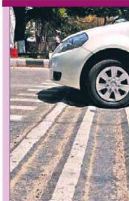
■ Rumble strips on the roundabout of Sectors 19, 20, 27 and 30.

visited the roundabout where the rumble strips have been set up. "They appreciated the concept and suggested that such strips should be laid on other roundabouts also," he said, adding that the road safety initiative was likely to be extended to other parts of the city this year.