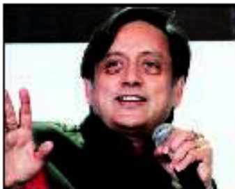
Tharoor says DU setting a benchmark with programme

Tharoor, who believes in leaving academic matters to academicians, says,